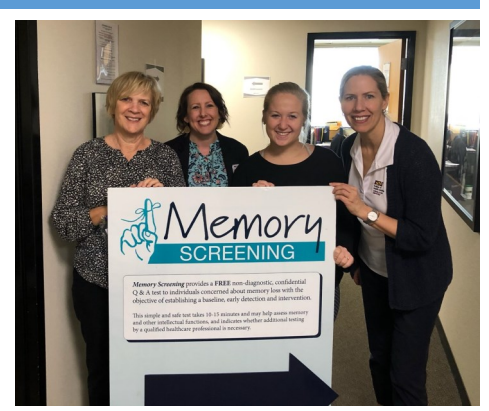
ASU volunteers at Memory Screenings

ARPF began an important collaboration with Arizona State University, Department of Speech-Language Pathology, where they assist with memory screenings in the Phoenix, AZ area.