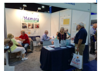
Offering Memory Screenings at Rotary International Conference