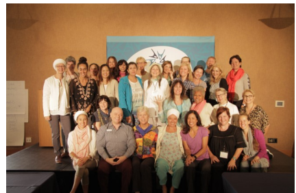
Brain Longevity Specialists, class of 2017